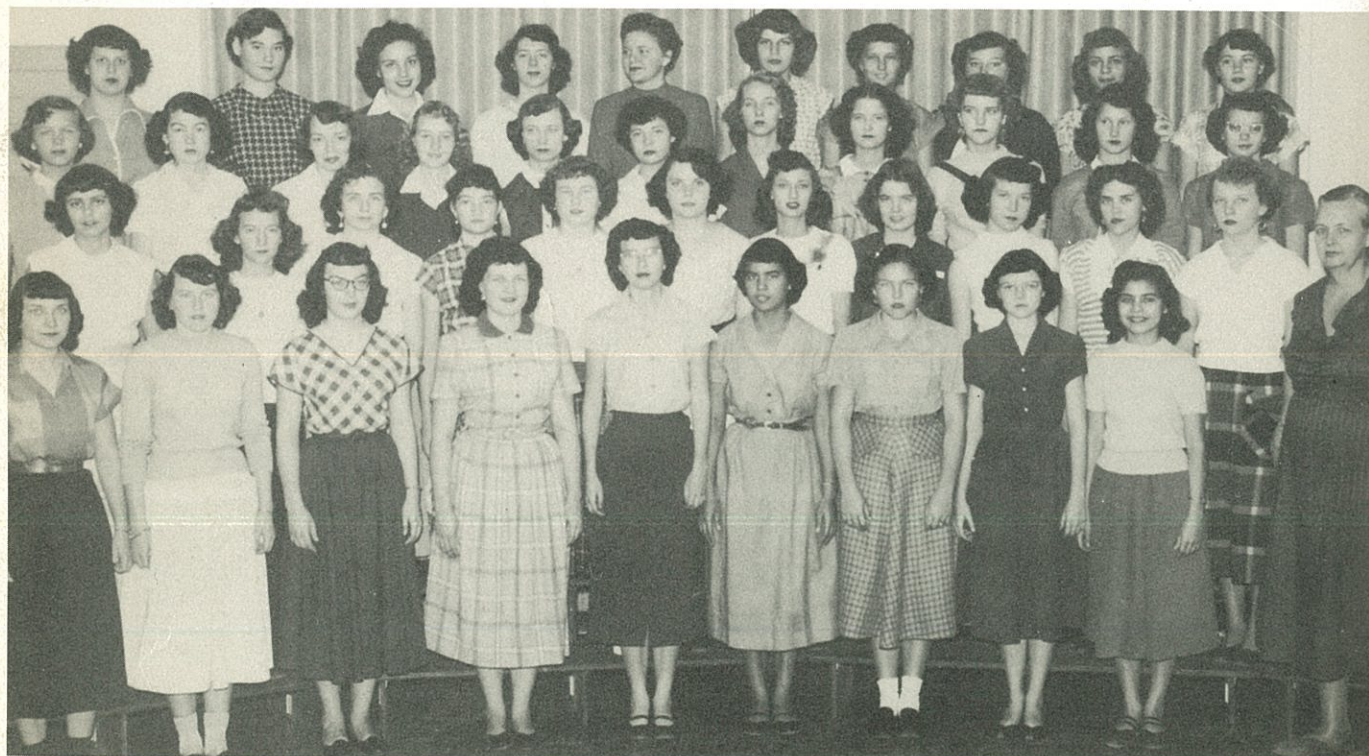
F. H. A.