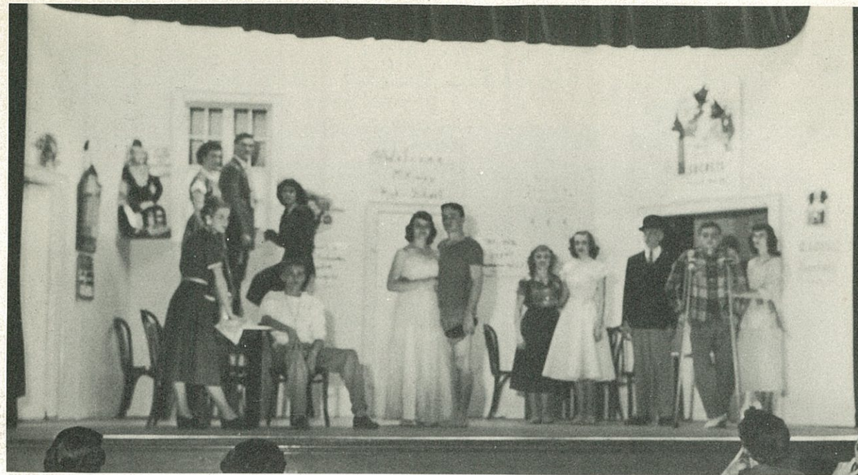
SENIOR PLAY -- "STRAWS FOR TWO"