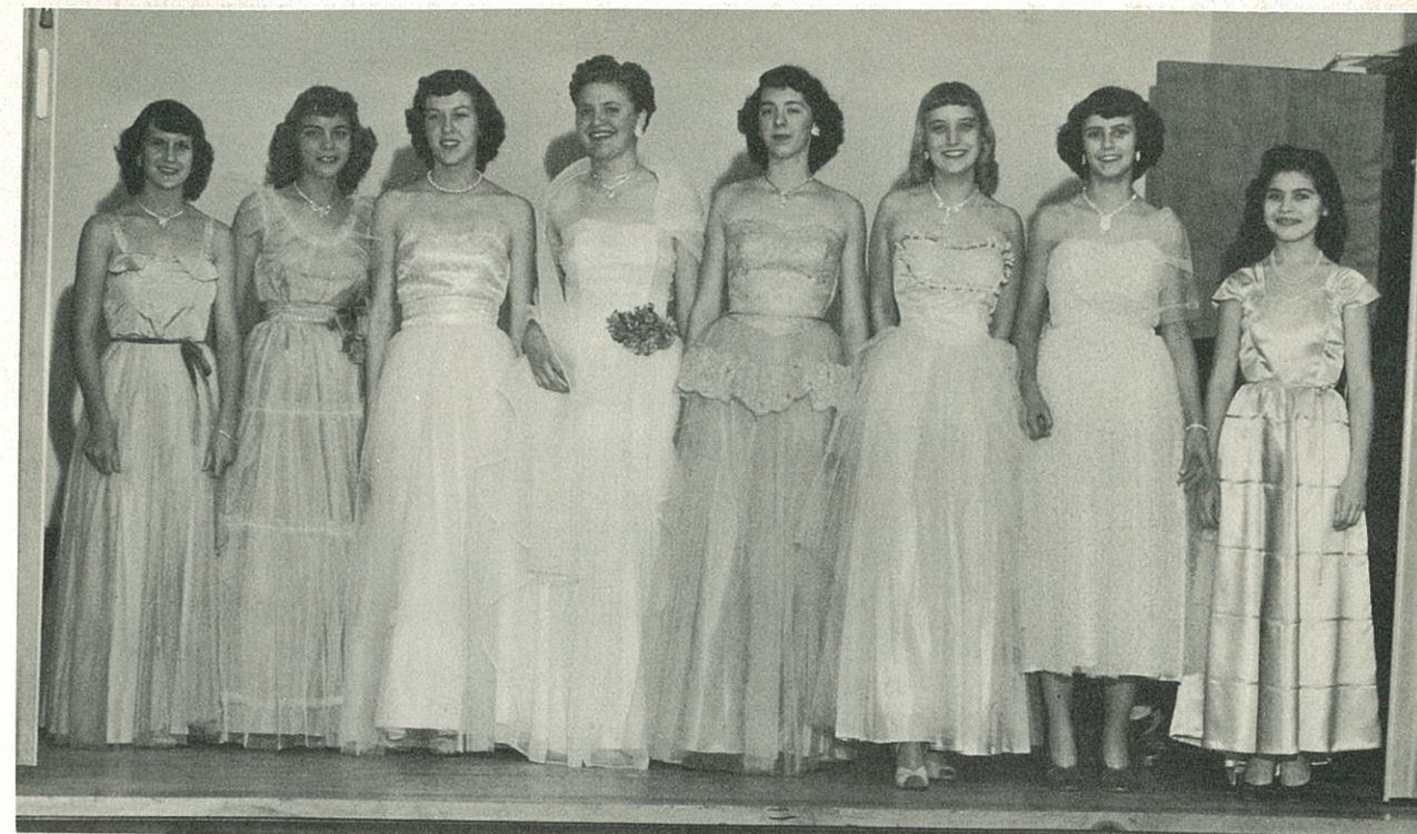
MISS WINK CONTESTANTS